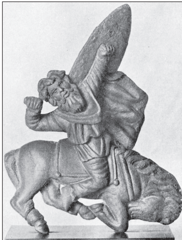
Figura 2. Bronze figurine of a German cavalryman. The detail of the Roman pectoral from Dalmatia. Kunsthistorisches Staatsmuseum, Wien. After Schumacher 1935: Taf. 33. Abb. 121.