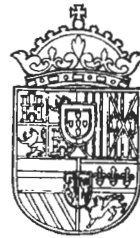
THE ARMS OF SPAIN