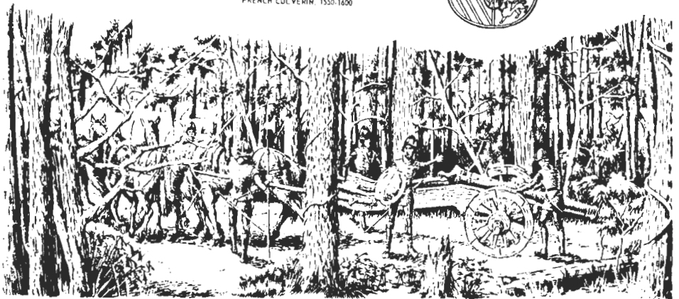
Early Spanish, French and German Cannon.