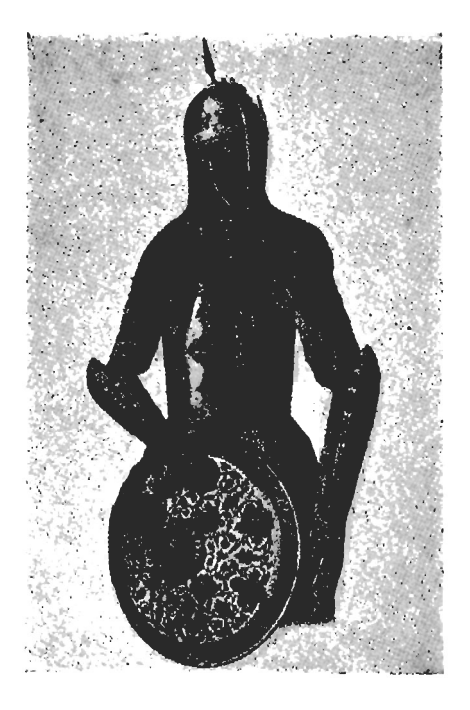
Fig. 3. Persian armour, early part of the 18th century. (Zarskoe Selo Collection).

To conclude, the typical armour suit (Indo-Persian) consisted of a shirt of chain-mail (zirah baktar), over which was buckled a cuirass in four pieces (char aina). On each fore-arm was an arm-guard (dastana), that on the right arm usually being longer than the other, as it was not protected by the circular shield (dhal). The head was covered by a hemispherical helmet with a nasal coming down in front, and