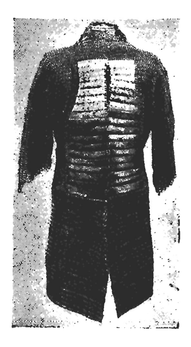
Fig. 1. Mail-shirt of Sultan Qaitbay. Egypt, 15th century. (Topkapu Saray Museum, Istanbul).

From casual references, coats of mail were worn singly or double, short or long, and some of them were not merely long but dragging, covering the horseman's legs. Links of this and earlier chain mail sometimes bear a stamped ornament, in the form of lines, grooves,