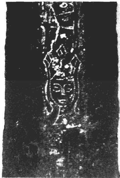
FIG. 2.— Crowned head on the sword.

Both the blade faces are covered with the remains of nearly identical decorations and inscriptions made of yellow metal, set (probably hammered in) into the previously carved grooves. The metal has almost